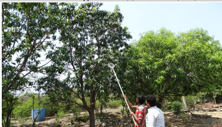
Fig. 2 MANGO HARVEST FROM THE TREE WITH KVK BRD MODEL